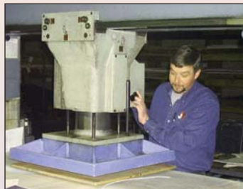
Die Cut Gaskets