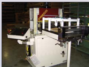
High-Volume Gasket Fabrication