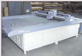
CAD/CAM Cut Gaskets